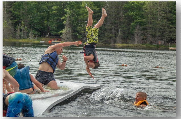
Is this what you hoped for this summer? Many kids did!